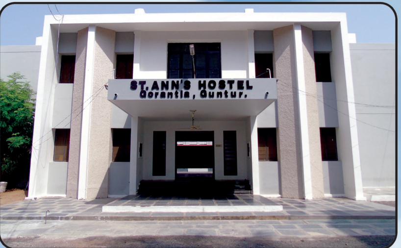
HOSTEL ADMINISTAVITE STAFF