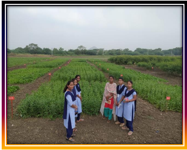
ANU Academic Exhibition