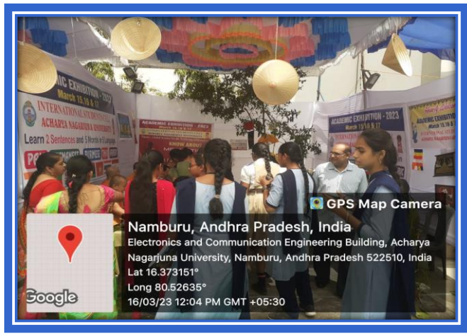
Semester Internship Programme