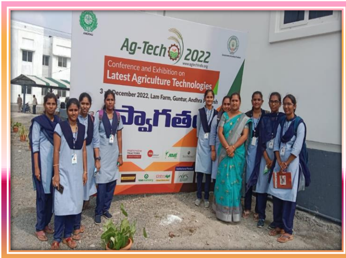
ANU Academic Exhibition