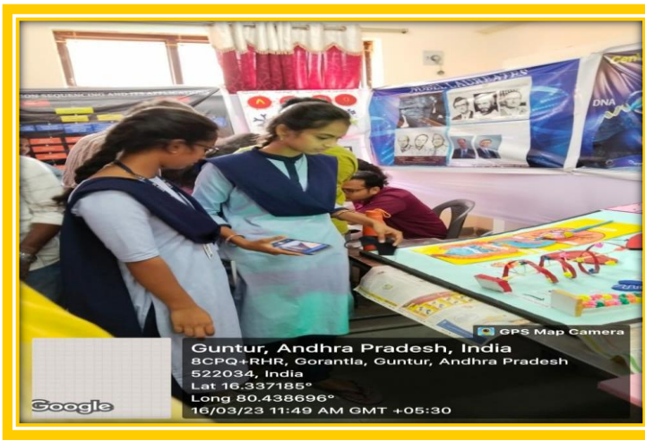
Semester Internship Programme