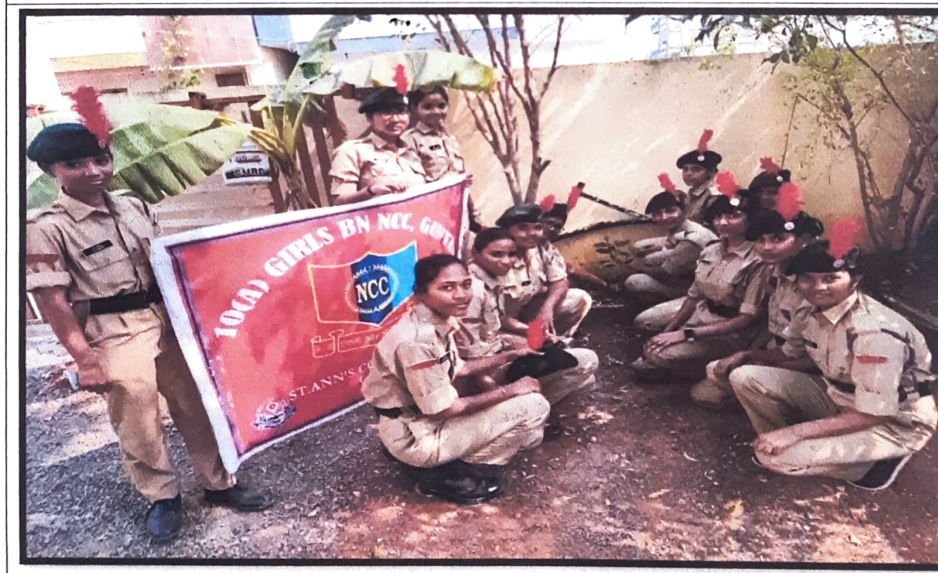
Students are Participated in Tree Plantation Programme