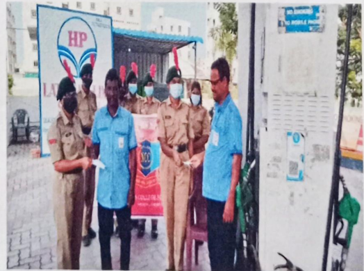
Our NCC cadets distributed masks to the people