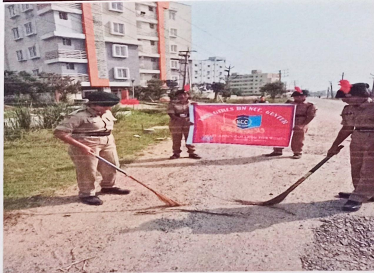
Cleaning surroundings by NCC cadets