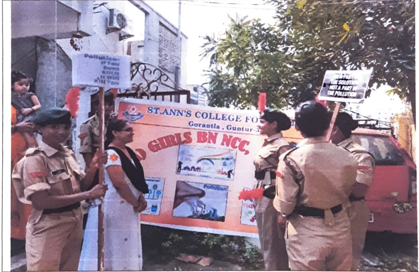
NCC cadets to spread awareness about the ill-effects of pollution on environment